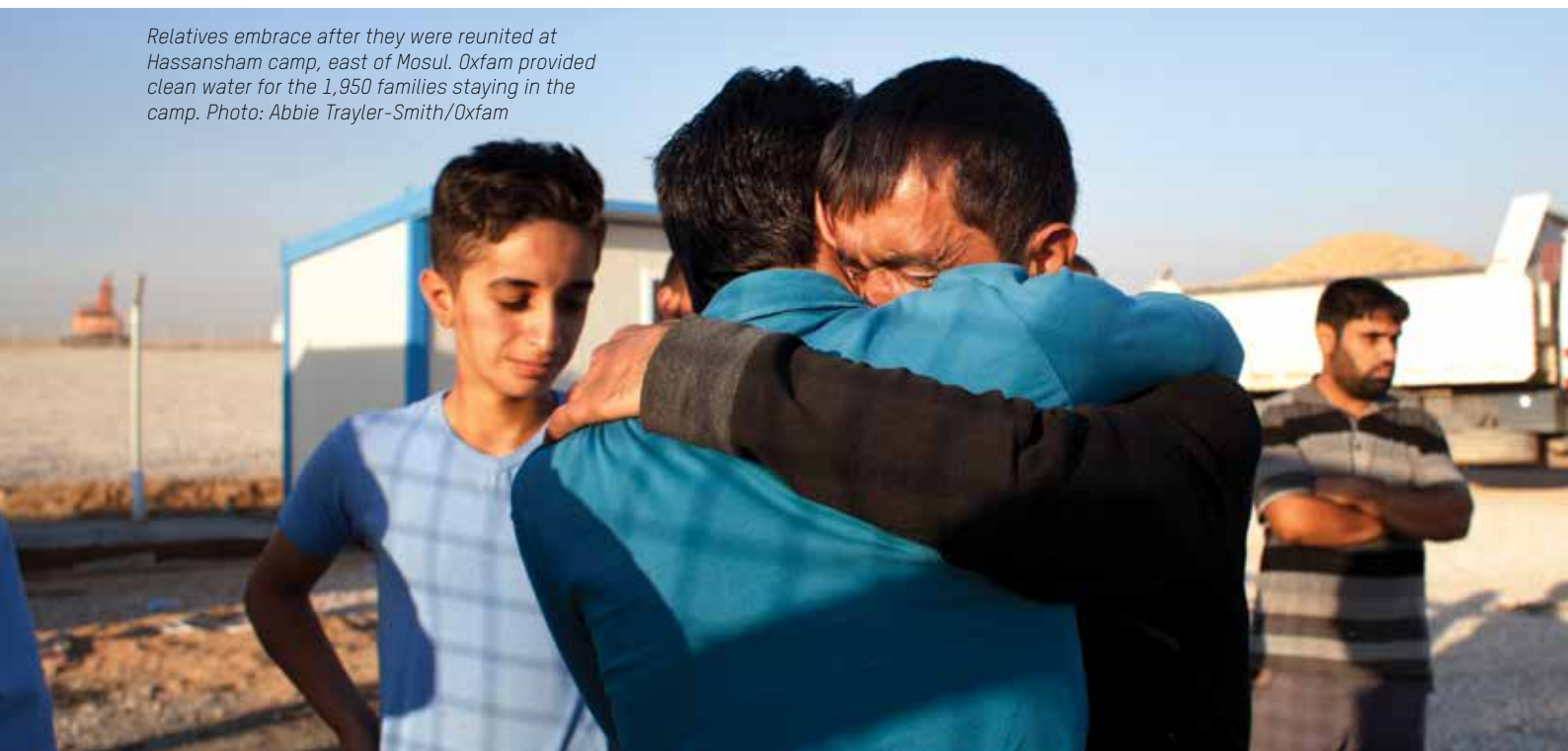
Relatives embrace after they were reunited at Hassansham camp, east of Mosul. Oxfam provided clean water for the 1,950 families staying in the camp.