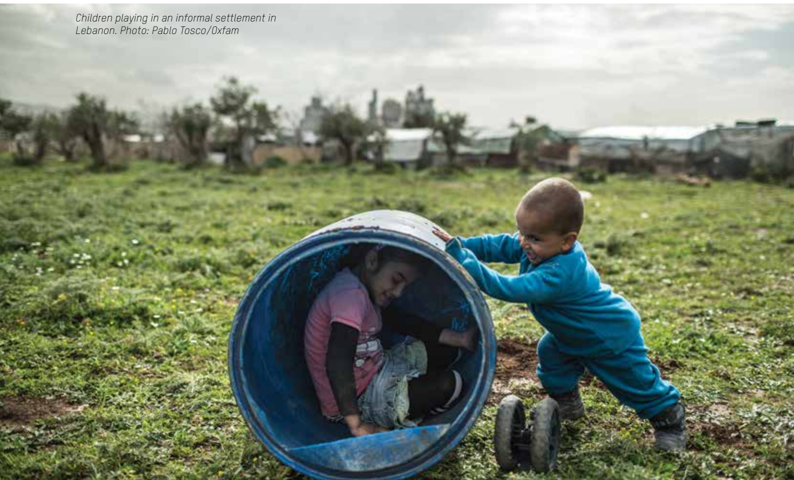
Children playing in an informal settlement in Lebanon.